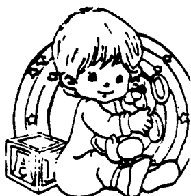
I Am a Child Of God