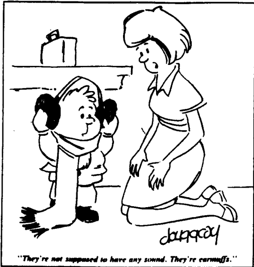
"They're not supposed to have any sound. They're carmiffs."

WHAT RUNS ACROSS THE COUNTRY WITHOUT MOVING? train tracks